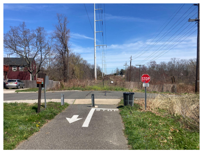
Southern end termination point with no guidance. Matawan/Aberdeen border Stillwell Street./Bank Street

This will have rotatable arrows for use in any direction Printed stencil approx: 48" x 20"