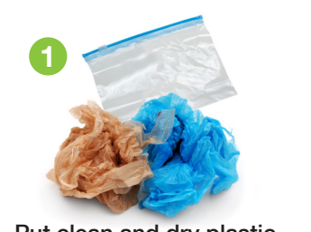
Put clean and dry plastic bags and plastic film inside a plastic bag.

Matawan Municipal Community Complex 201 Broad Street Matawan, NJ 07747